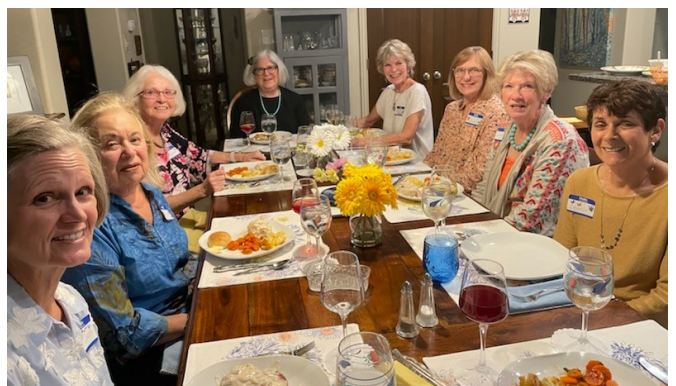
Come to Dinner gathering, April 2022