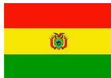
Flag of Bolivia