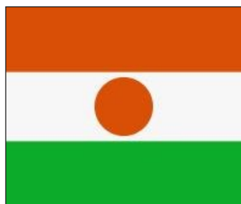
Flag of Niger

When: Mondays, June 7, 14, 21, 28, 5:00 p.m.