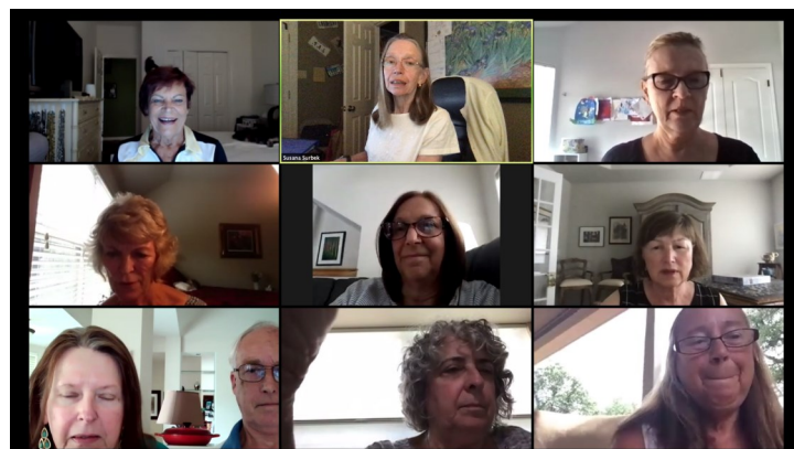
A recent Zoom Happy Hour