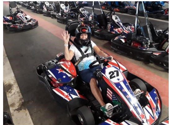
Go-cart, 84th birthday