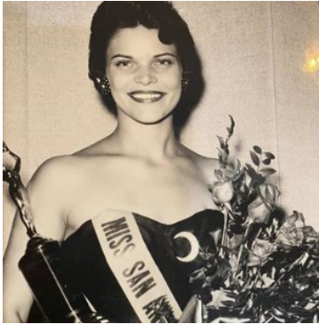
Miss San Angelo

We have been getting together almost every week since the virus. Wearing masks and social distancing, of course. We'd bring a lunch, cool off in the pool, and just visit. She always said, "I'm not going to stop living because I haven't got that much longer to live, and no virus is going to stop me." Oh, how she so enjoyed her life.