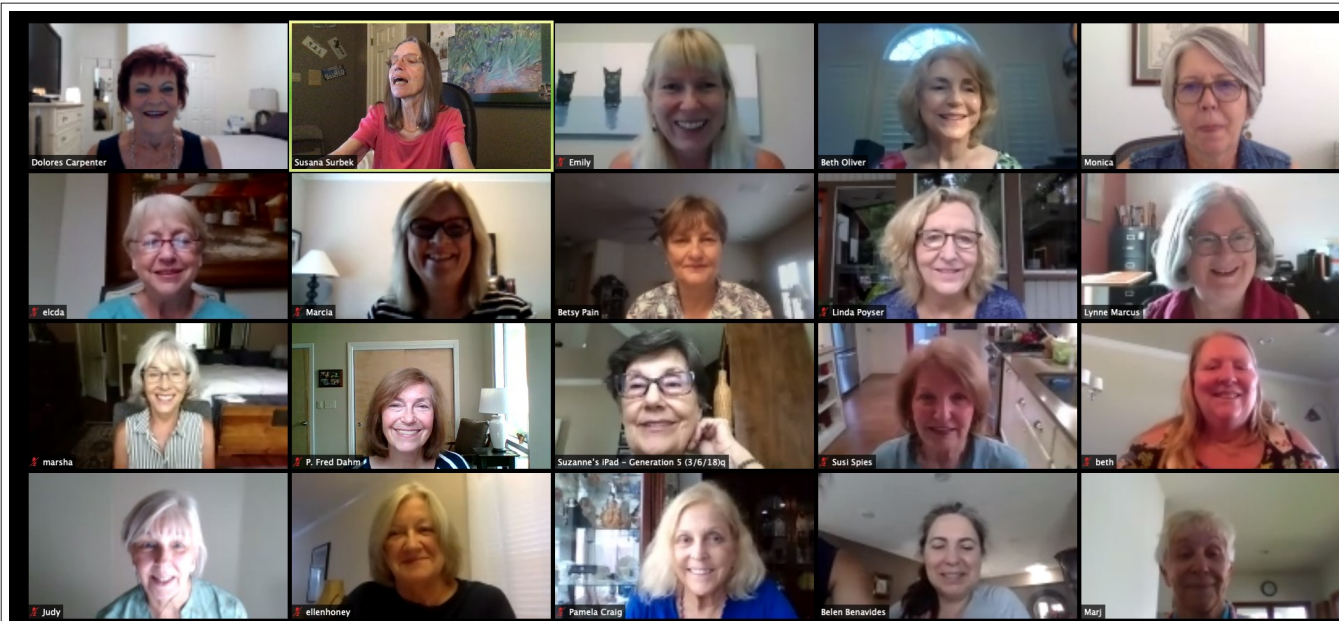
July 2020 Board Meeting