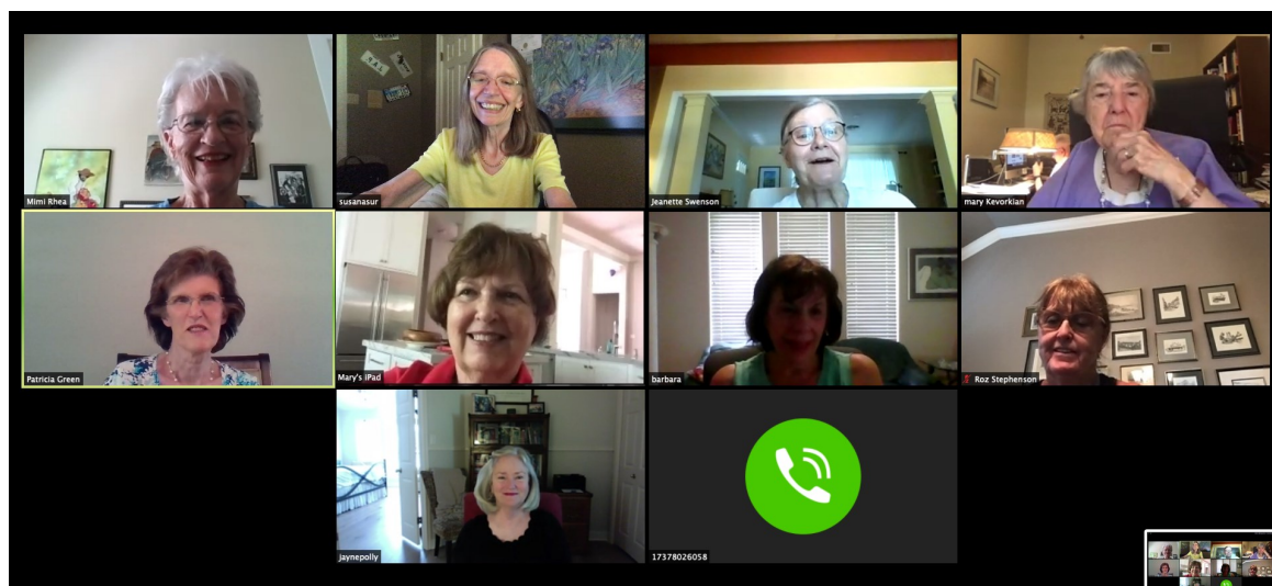
Rousing discussion at the June meeting of Bluebonnet Book Club