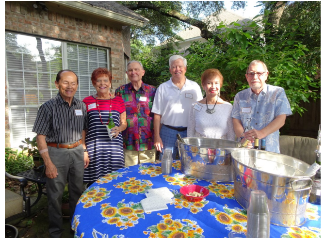
TG Social, July, 2019