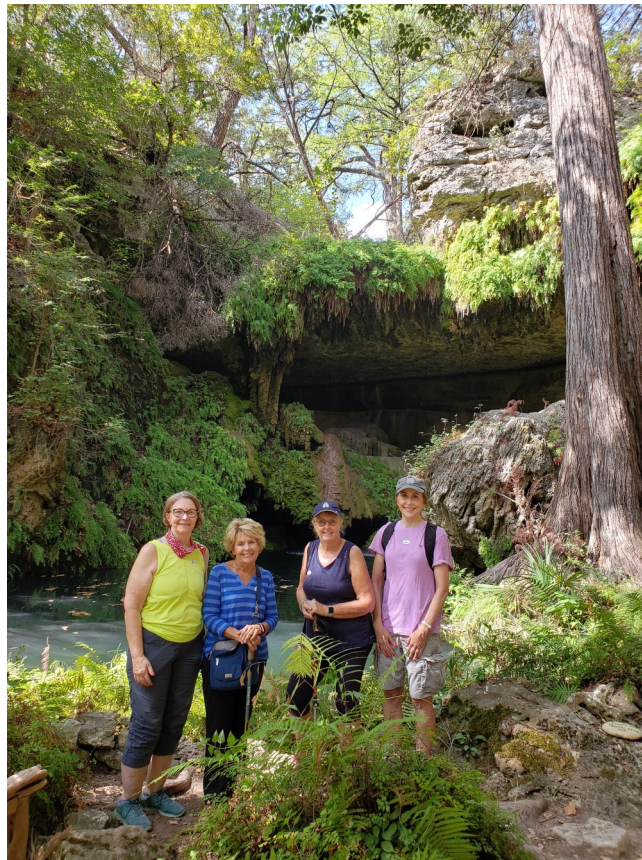
Hiking at Westlake Nature Preserve