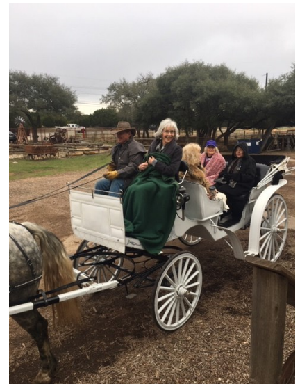
Daytrippers at the Buggy Barn Museum, January 2020