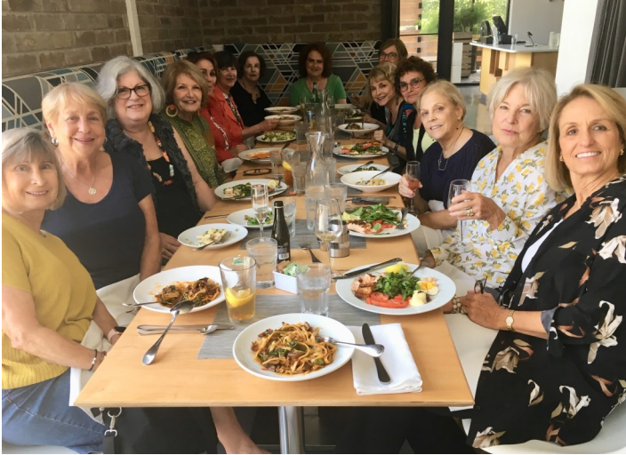
Lunch Bunch at 68°, June, 2019