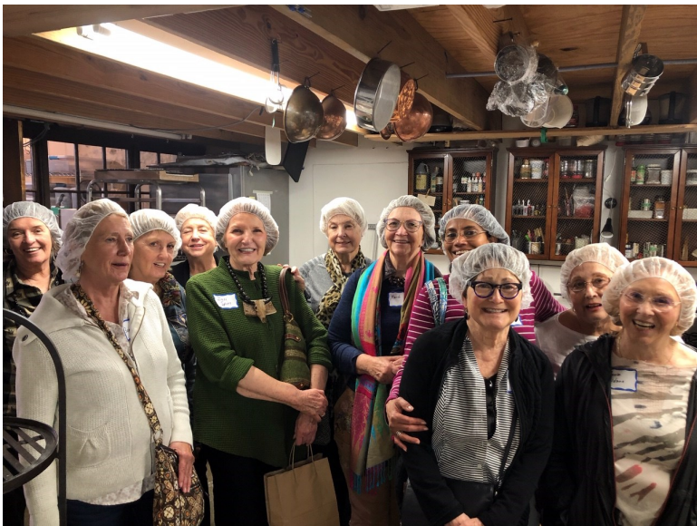
Daytripper visit to Hico and Hamilton, March 10, 2020