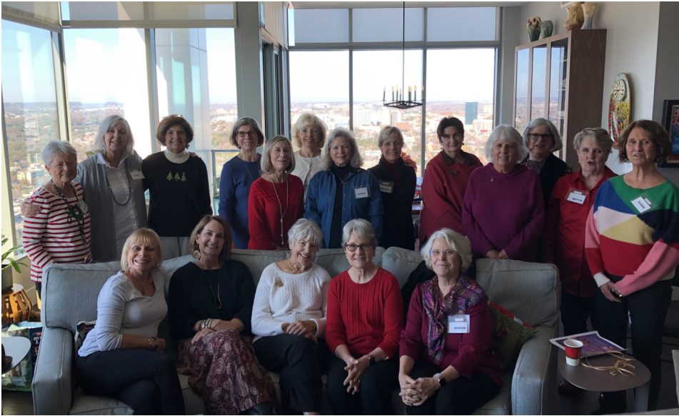
Afternoon Mystery Book Group