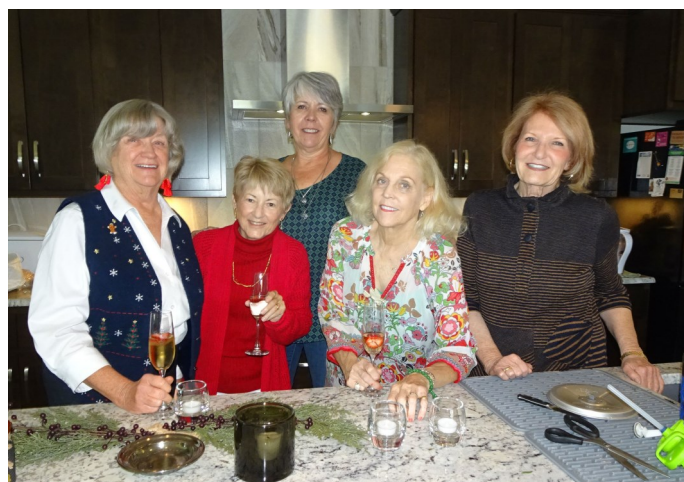
From the December, 2019 Board Meeting (back when meetings were "live")