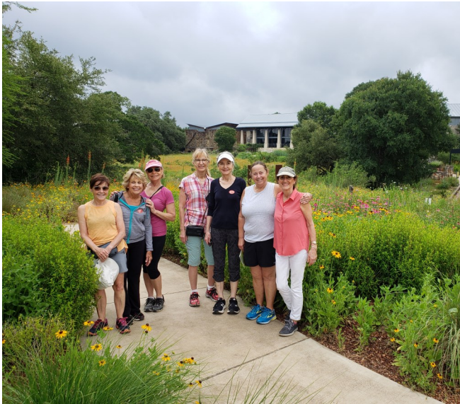
Happy Trails visit to Wildflower Center