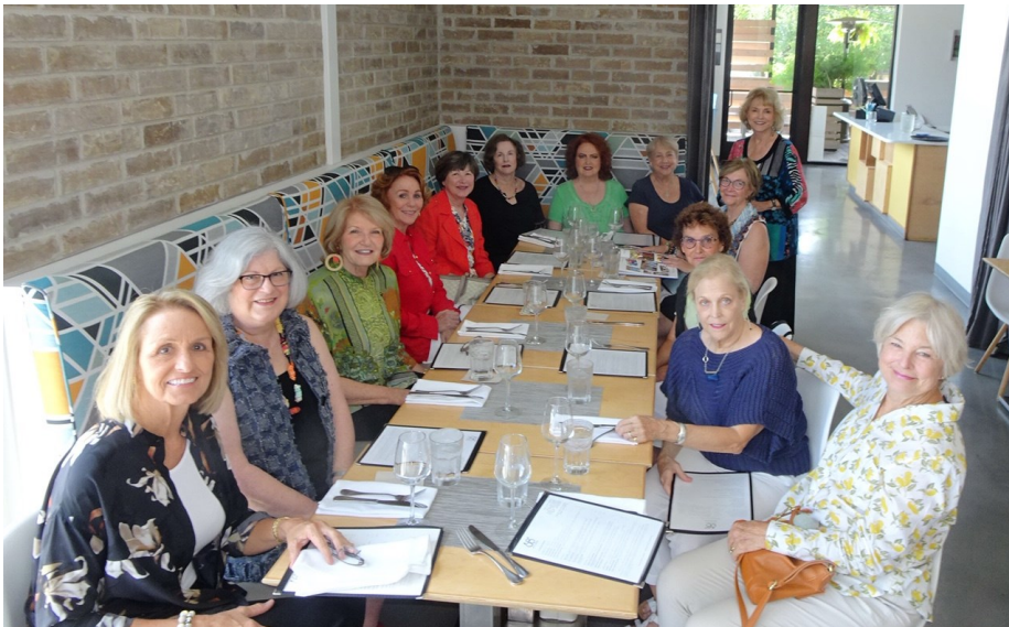
Out-to-Lunch Bunch at 68 Degrees Kitchen, June 28