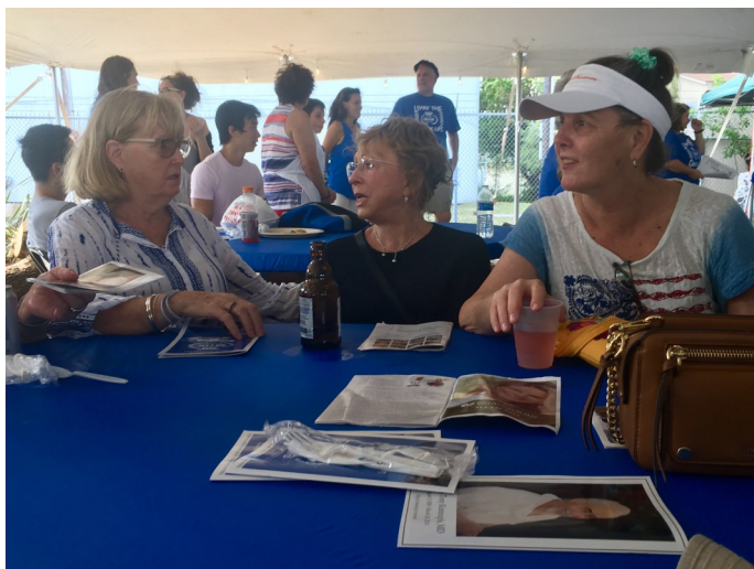
Bring a Plate at the Greek Festival