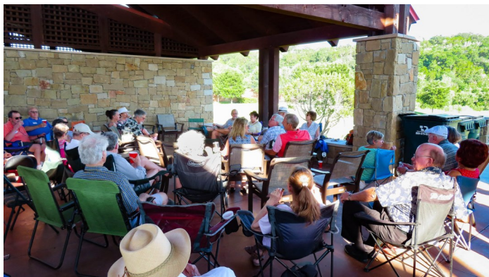
Combined North and South Cinema Groups BBQ