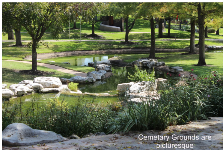
Cemetery Grounds are picturesque